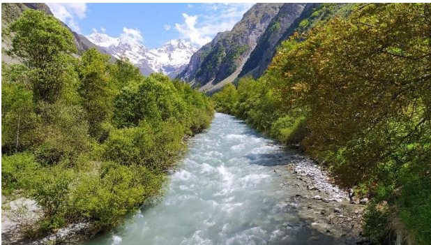
The Séveraise river.

In a plebiscite manner the 5 th edition of this particular workshop offers juniors to i) present and discuss , and ii) hands-on practice of various measuring principles in a setting that gives more opportunity to learn and to share compared to regular conferences.